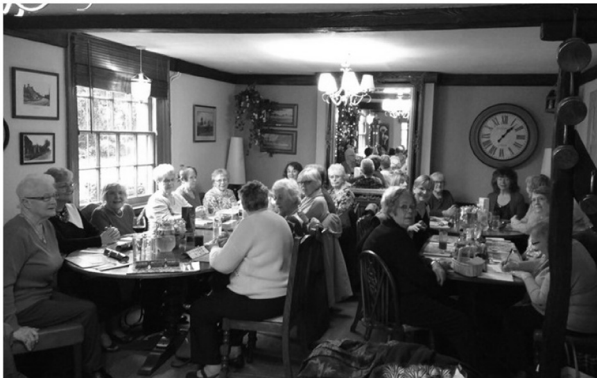
A wonderful world where the word Covid was as yet unknown

In the meantime, just to make sure we will all recognise each other when we next meet up, here is a photograph of our most enjoyable New Year lunch at the Hare and Hounds in January 2020.